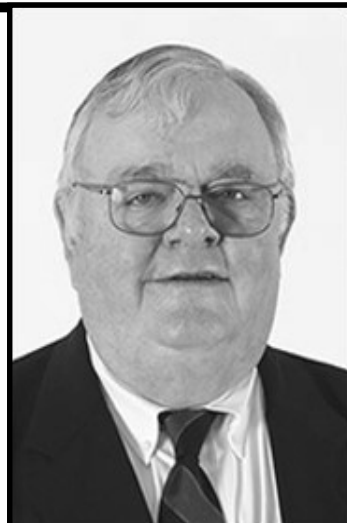
Photo from the McNess website, a company he headed for many decades. ▶